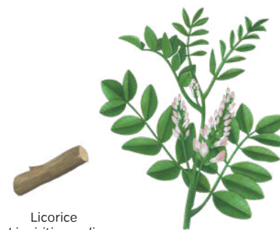
Licorice Liquiritiae radix